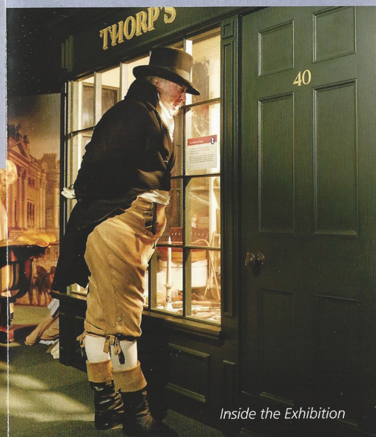
Inside the Exhibition