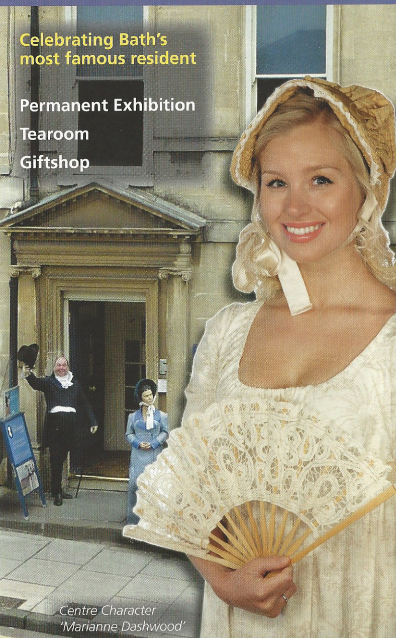
Centre Character 'Marianne Dashwood'