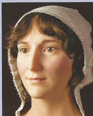
The Jane Austen Waxwork

Throughout the experience there are exhibits that explore Jane's life in Bath, her family, places of residence and Bath society. You can learn about the main entertainments of the day; dancing, socialising, card games and tea drinking.